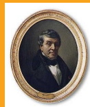
Jean Claude Eugène Péclet [1793-1857]