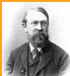
Ernst Mach [1838-1916]

Solutions of the Navier-Stokes-Fourier system converge in the limit of low Mach and high Reynolds and Péclet number to the Euler-Boussinesq system.